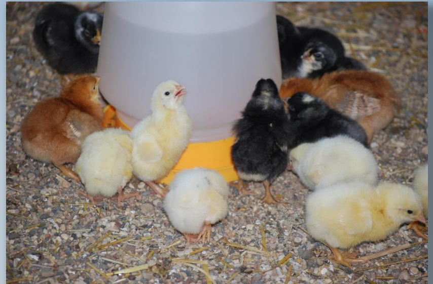
Pam Zaabel, ISU