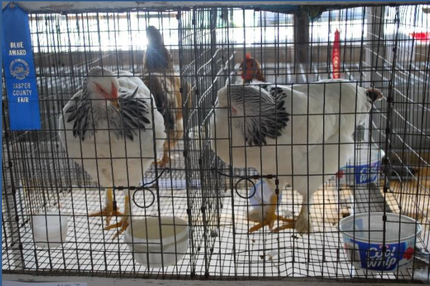
Pam Zaabel, ISU