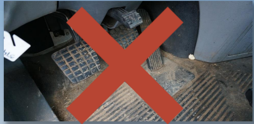
Danelle Bickett-Weddle, ISU