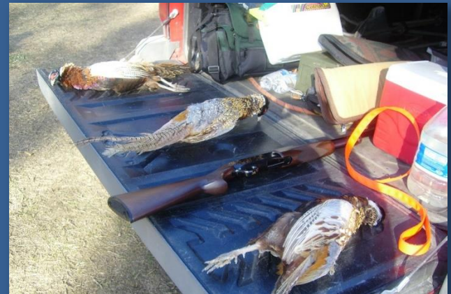
Renee Viehmann, licensed under Creative Commons