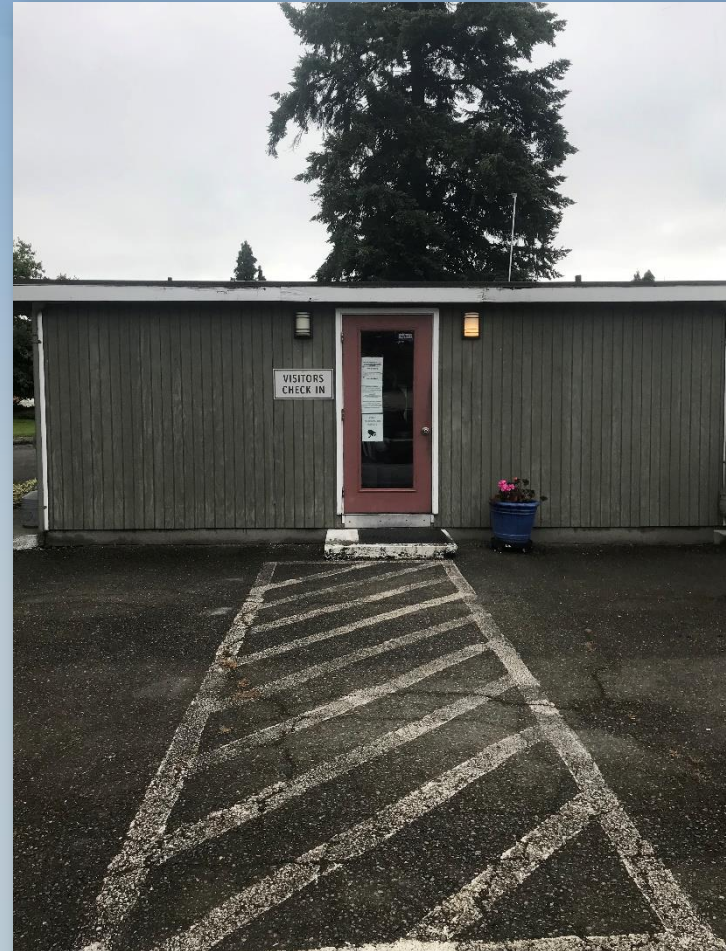
Reneé Dewell, ISU