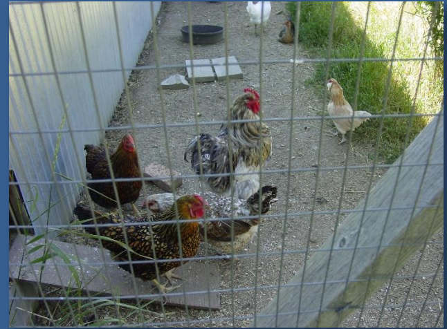
Danelle Bickett-Weddle, ISU