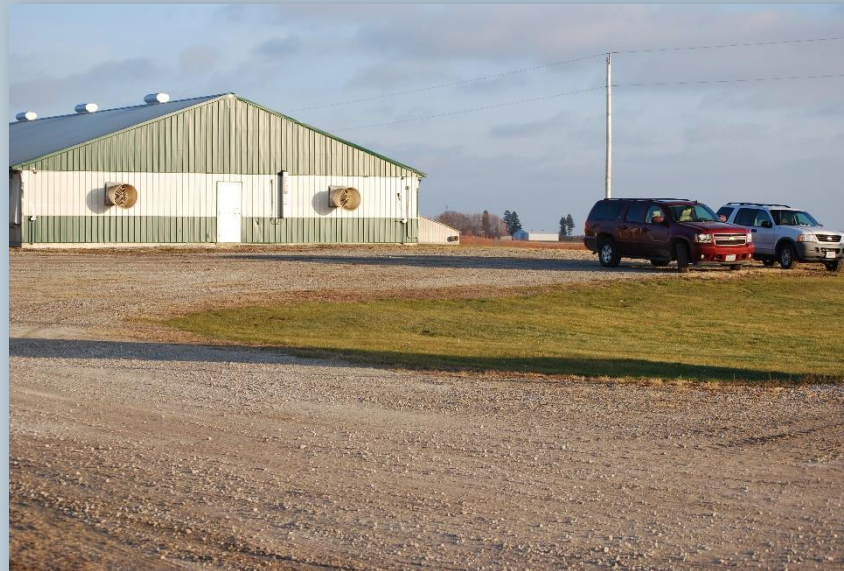
Pam Zaabel, ISU